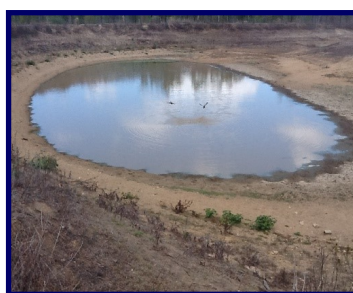
Low water supplies

Many surface storages, along with underground supplies, appear under pressure, with many growers who, during past visits have been confident in their water reserves, are now investigating measures to further reduce their water use. Under the RWUE-IF initiative, and the development of Irrigation Drainage and Energy Management Plans (IDEMPs) for production nurseries, water balance and water security planning are priority issues.